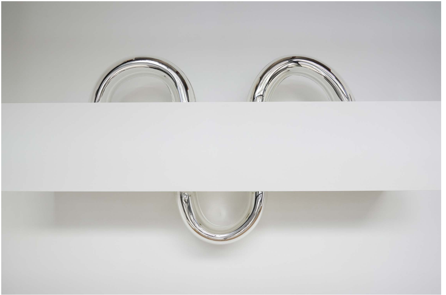
HYPHAE 01 Ruth Allen 2022 Blown, hot sculpted mirrored glass