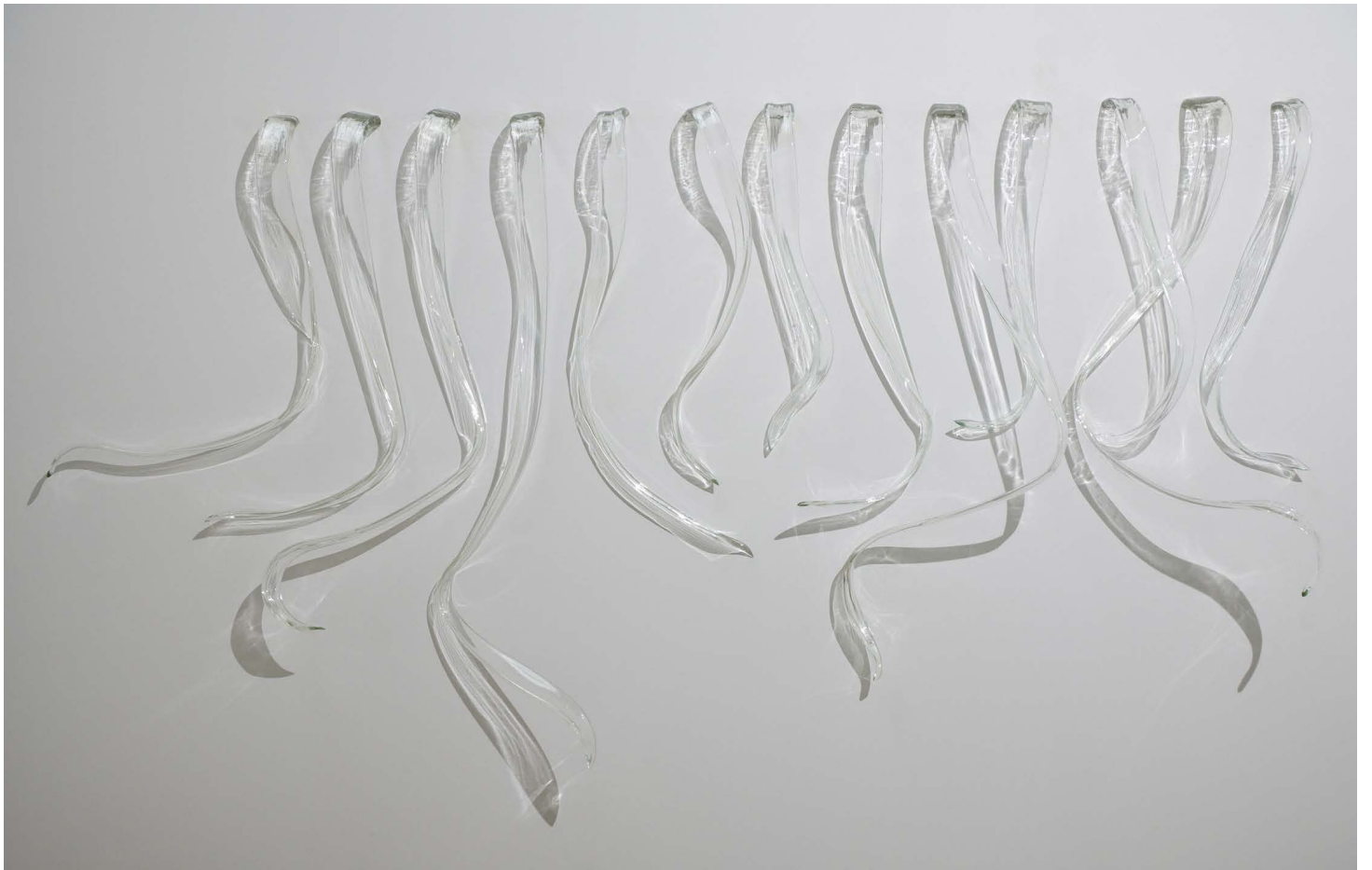
GUST Ruth Allen 2022 Blown, hot sculpted clear glass