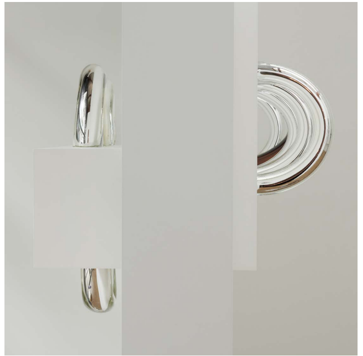
HYPHAE 01, 02 DETAIL Ruth Allen 2022 Blown, hot sculpted mirrored glass