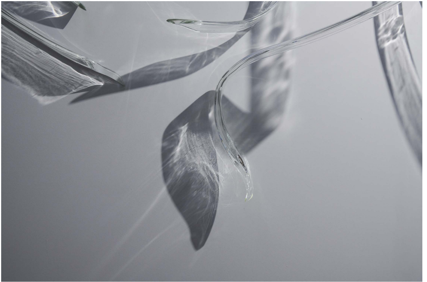
GUST DETAIL Ruth Allen 2022 Blown, hot sculpted clear glass