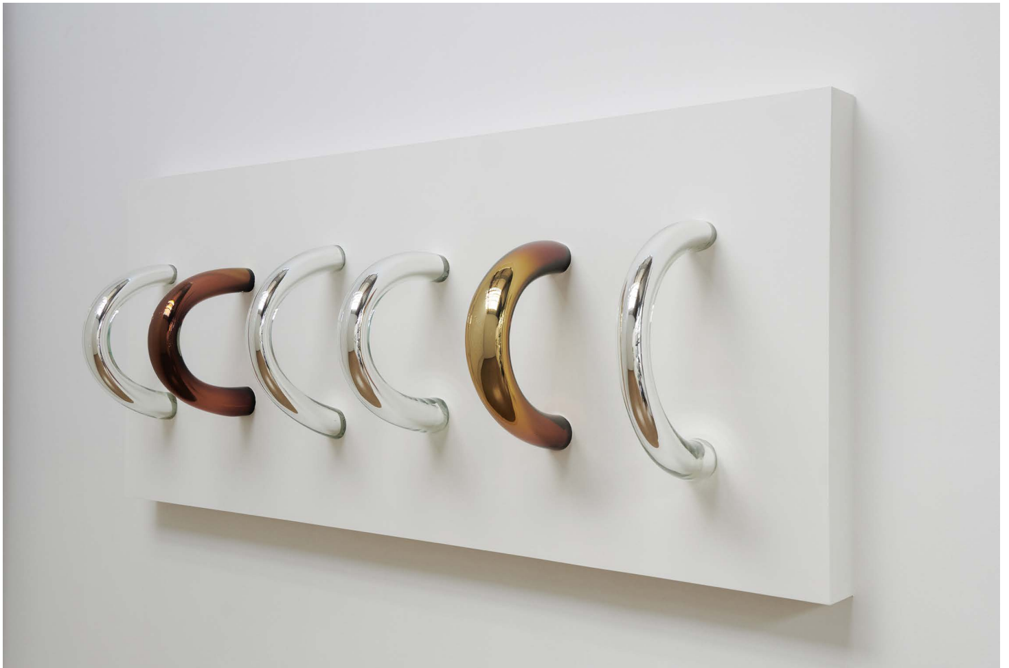
HYPHAE 03 Ruth Allen 2022 Blown, hot sculpted mirrored glass