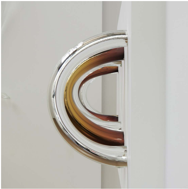
HYPHAE 03 DETAIL Ruth Allen 2022 Blown, hot sculpted mirrored glass